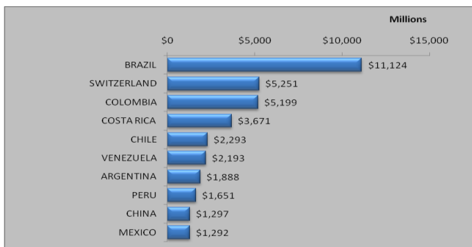
MIA's Top Trade Partners by Total Value In US Dollars