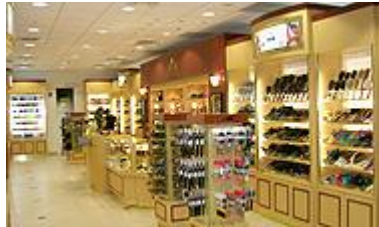
Central Terminal Shopping Stores