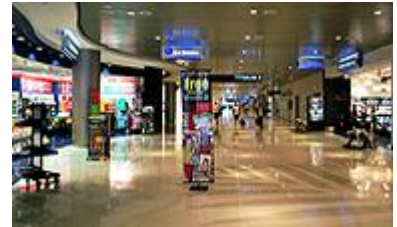
South Terminal Shopping Stores

North Terminal - Central Terminal - South Terminal - Terminal Map