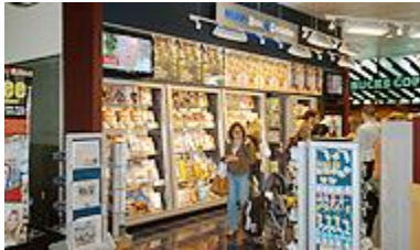
North Terminal Shopping Stores