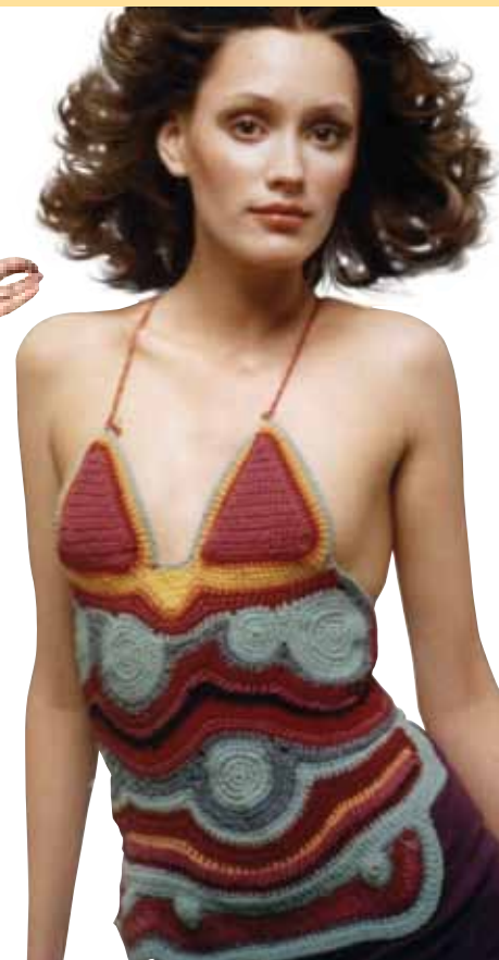
Cotton yarn crocheted halter, 1969