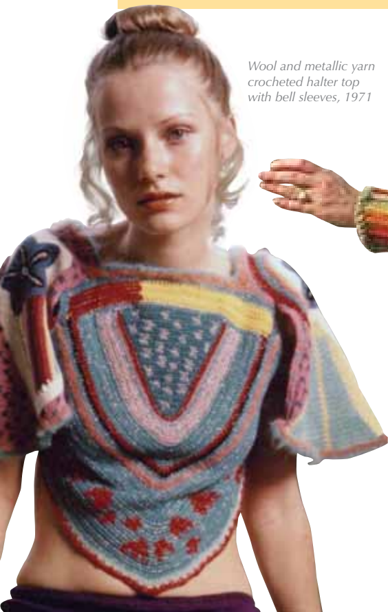
Wool and metallic yarn crocheted halter top with bell sleeves, 1971

"Once a piece is almost to the point of completion, it takes on a life of its own, and starts telling you what it wants to be." DINA KNAPP