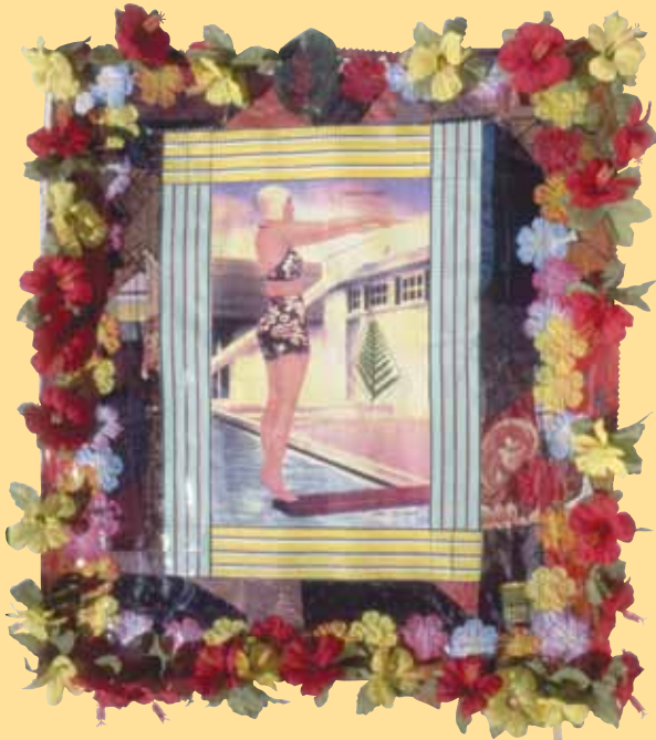
Above: Perfect Form , 1994, mixed media vinyl collage, 27" x 32" On cover: Rainbow crocheted tapestry (detail) , 1985

Central Terminal Gallery, just past security check point