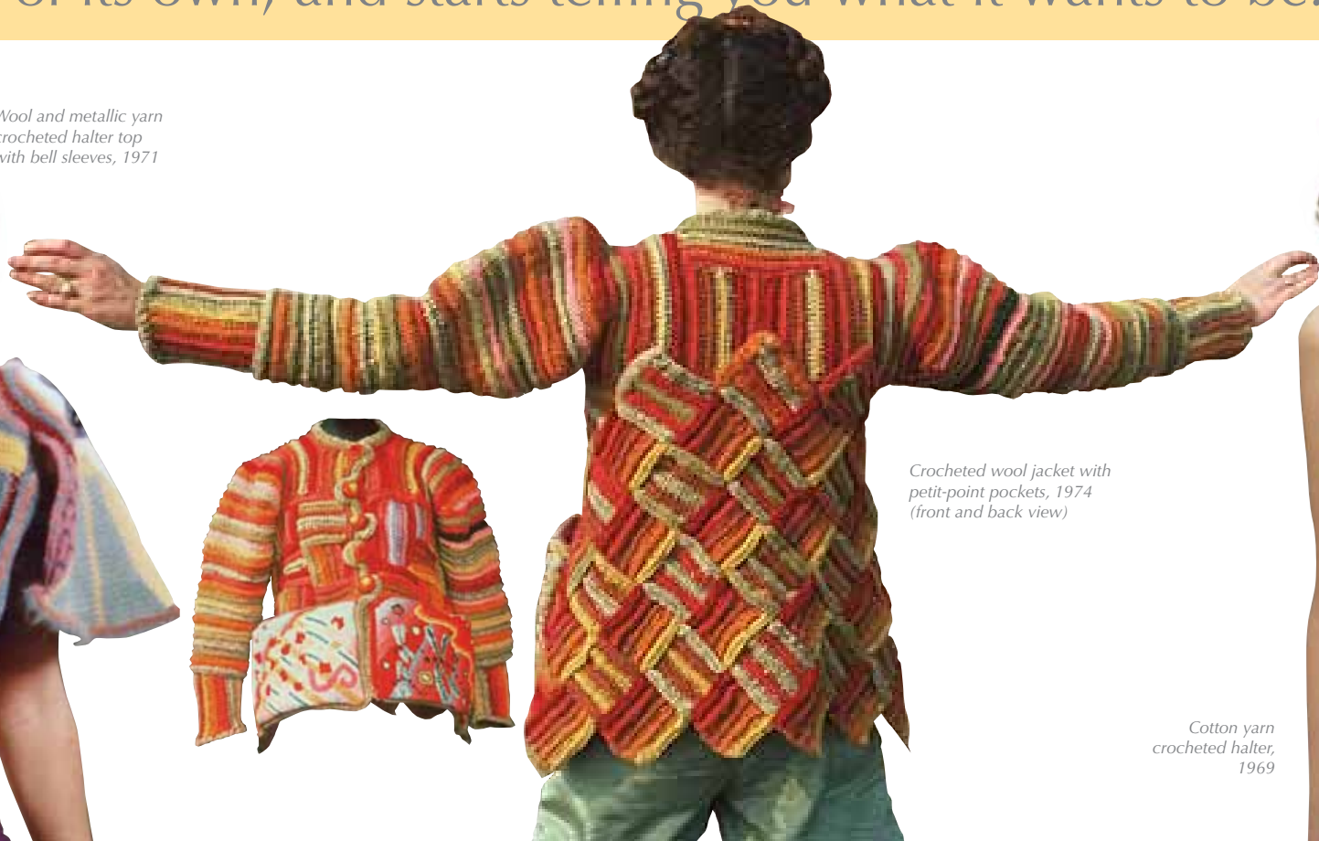
Crocheted wool jacket with petit-point pockets, 1974 (front and back view)